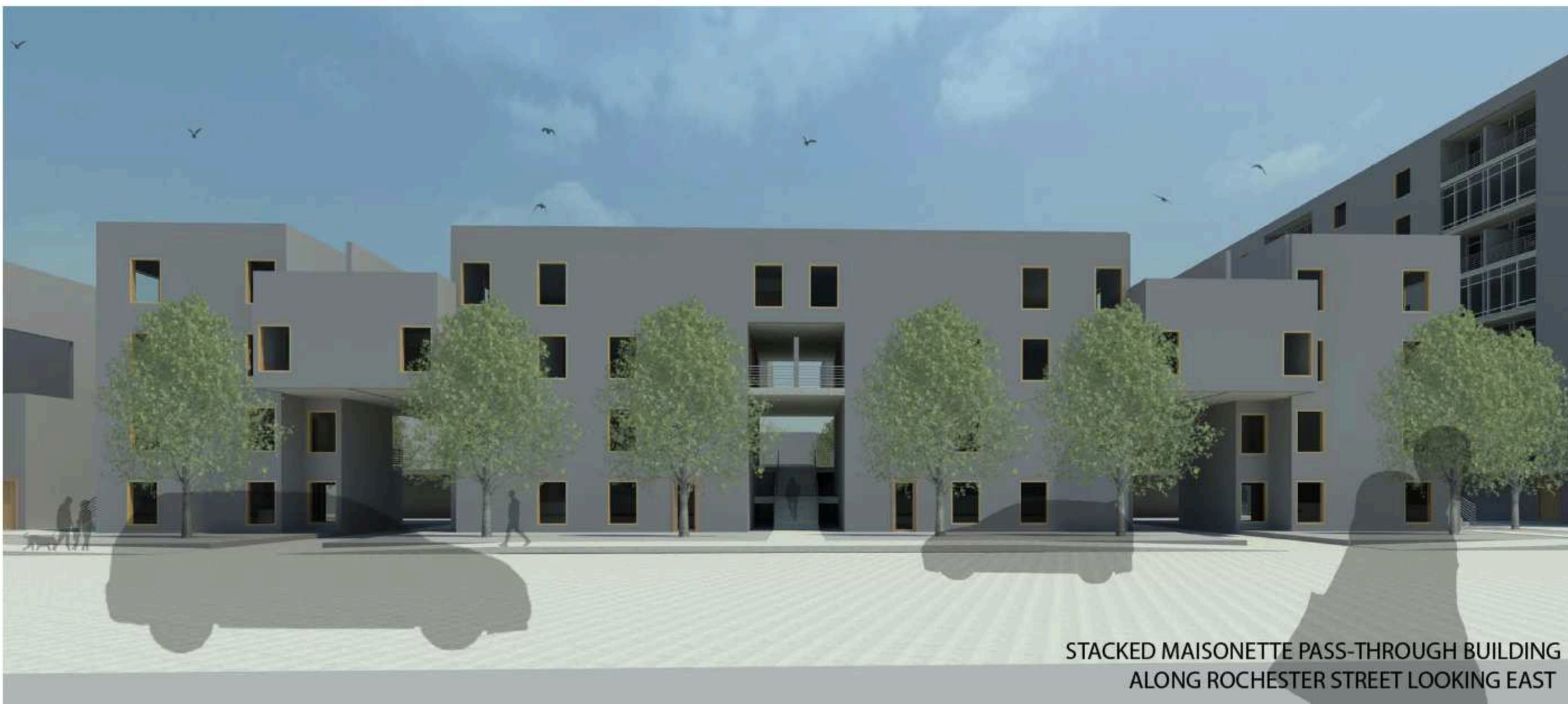
STACKED MAISONETTE PASS-THROUGH BUILDING ALONG ROCHESTER STREET LOOKING EAST