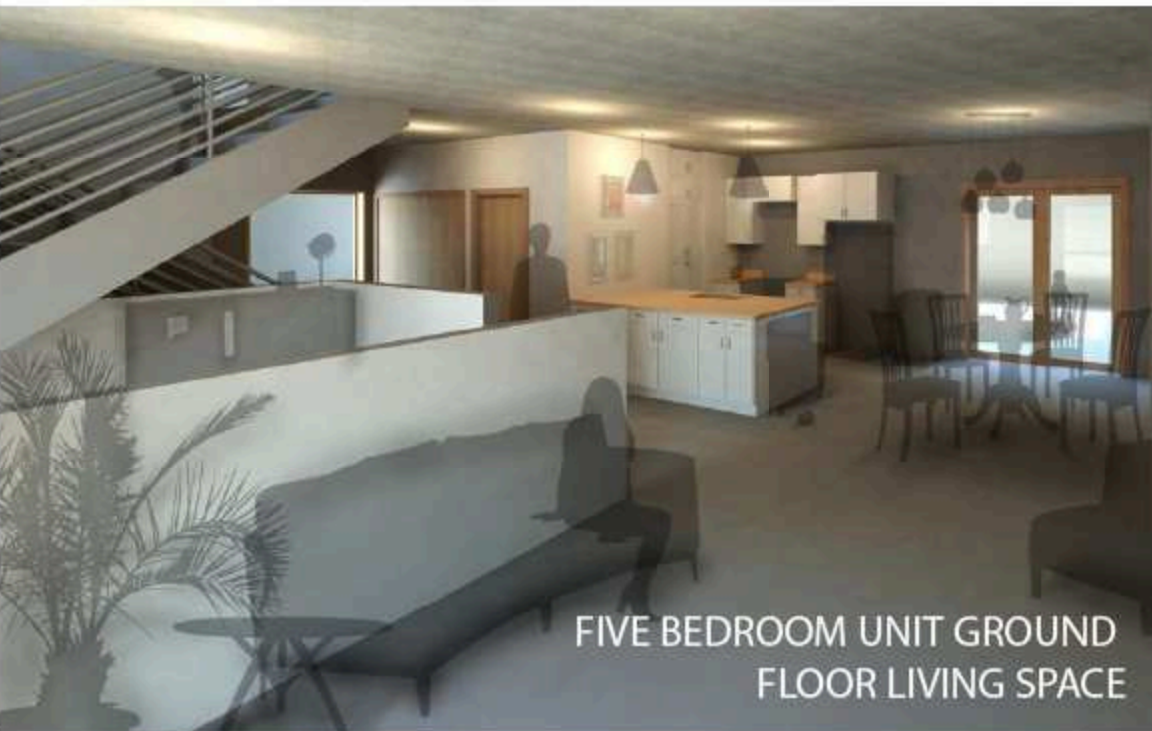
FIVE BEDROOM UNIT GROUND FLOOR LIVING SPACE

These volumetric subtractions generate private outdoor spaces that serve as unit terraces. They also allow fresh air and afternoon daylight to penetrate through the slab to the communal green beyond, while providing through-views for the buildings located in the vicinity of the site.