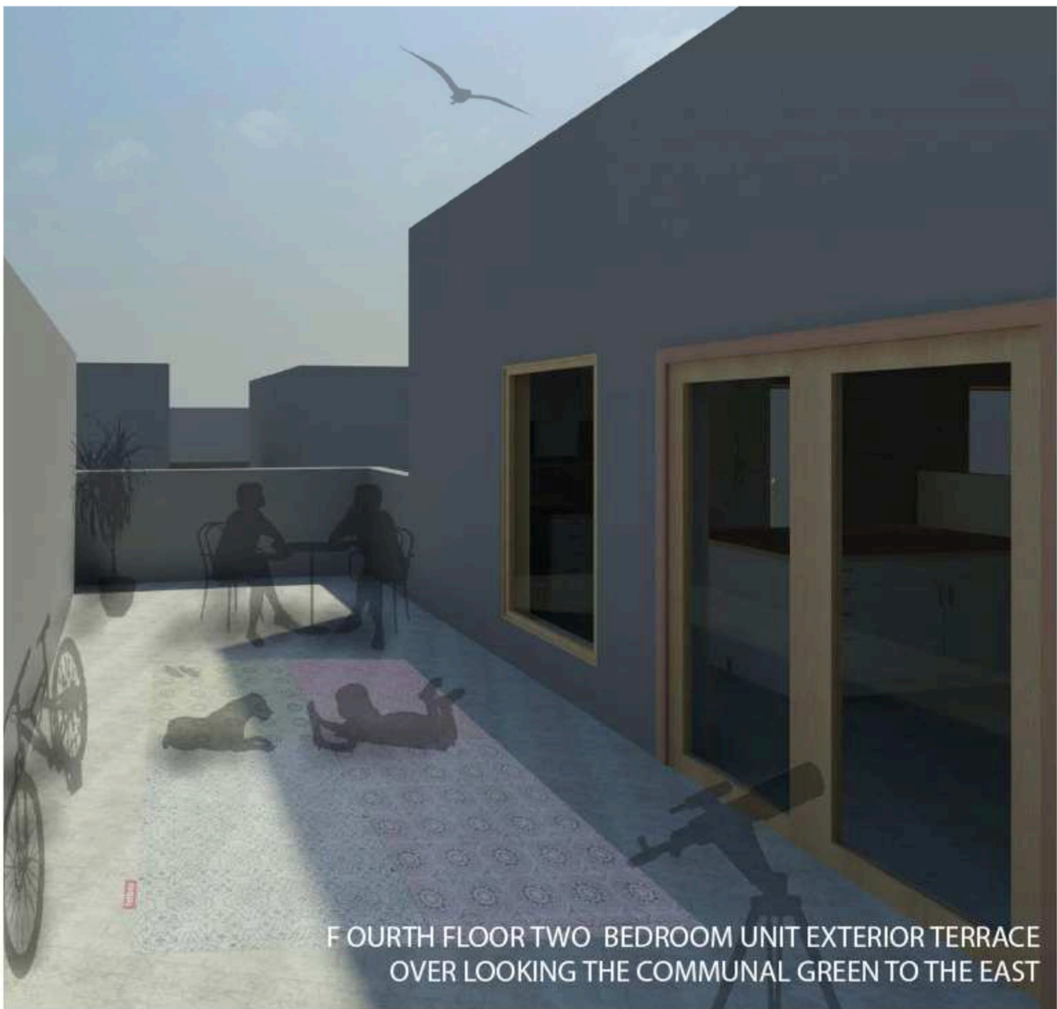
FOURTH FLOOR TWO BEDROOM UNIT EXTERIOR TERRACE OVER LOOKING THE COMMUNAL GREEN TO THE EAST

The longest of the three Stacked Maisonette Pass-Through bar is punctured in three places on its first floor with vehicular and pedestrian access points. Two openings lead cars to a roofed surface parking lot and one, the middle one, leads to a stair and to a second grouping of Stacked Maisonette Pass-Through (12 in total) atop the parking roof. The slab is also punctured on the third and fourth floor.