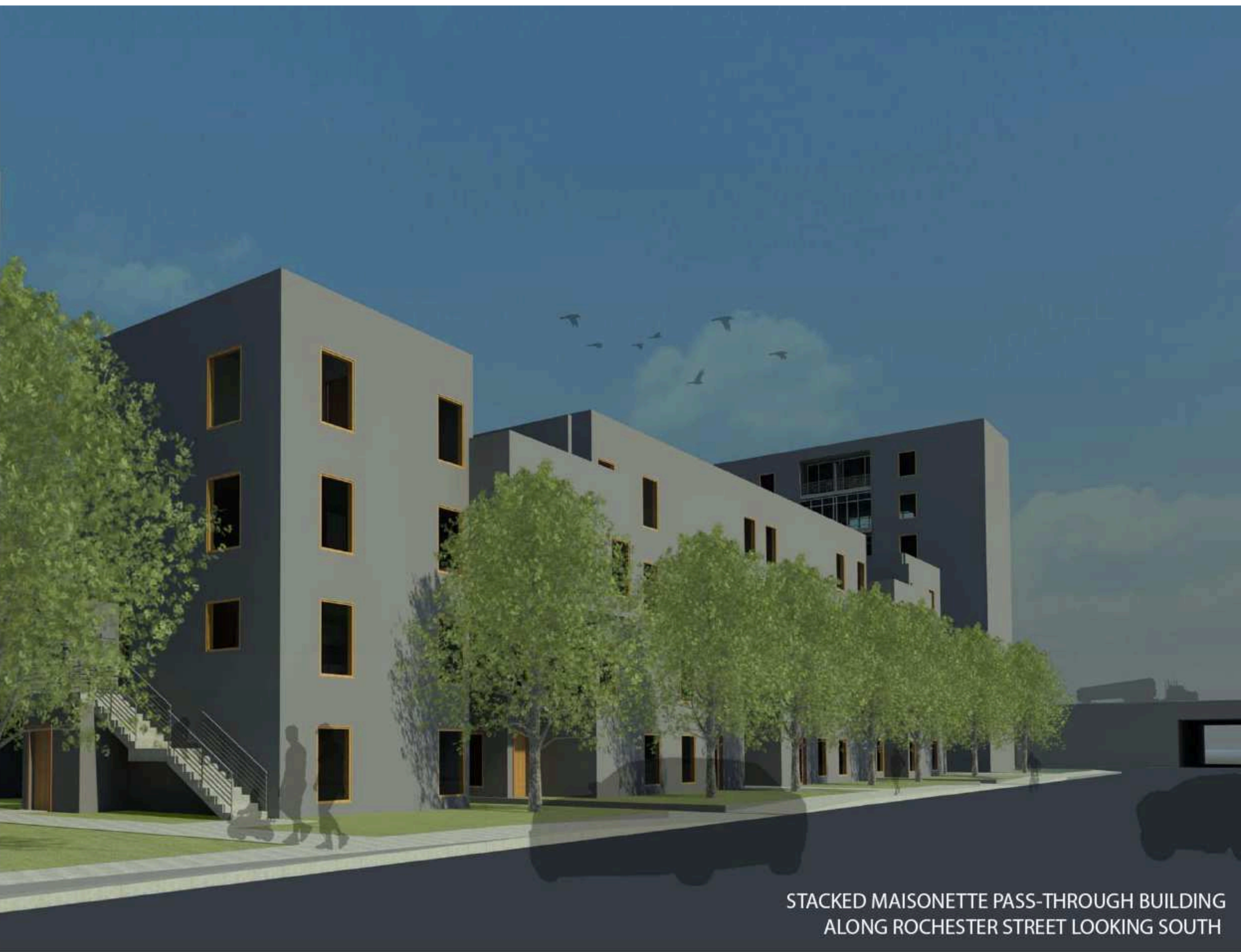
STACKED MAISONETTE PASS-THROUGH BUILDING ALONG ROCHESTER STREET LOOKING SOUTH

Grade level units have access to private rear yards, while upper units have access to exterior terraces. The unit plans follow principles shared with the other building types.