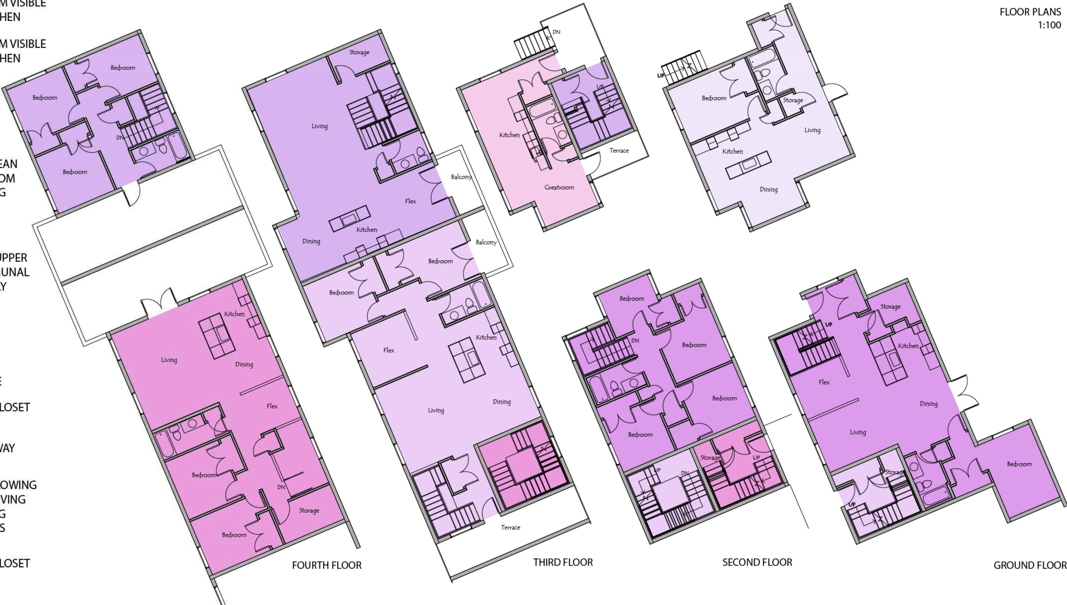
FLOOR PLANS 1:100