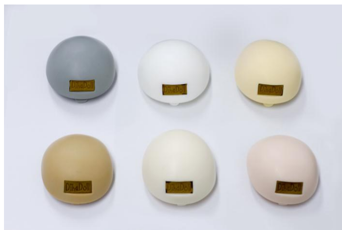
Figure 4.1: The six options for the skin colors of BJDs (Dikadoll, n.d.).

The preference for light skin tones demonstrated by contemporary Chinese doll-mommies and doll-daddies’ consumption has a historical background and a traditional cultural root in China. Light-colored skin, hairless and without blemishes, has been praised by the Chinese since antiquity, as the old Chinese saying goes: “One white skin can cover three kinds of ugliness (yibai zhe sanchou)”. Traditionally, this whiteness standard of attractiveness applied to both females and males among the Chinese. In classic Chinese poems, the skin of beautiful women was often compared to “snow”, “ice”, or “jade” to indicate the qualities of transparency, delicacy, smoothness,