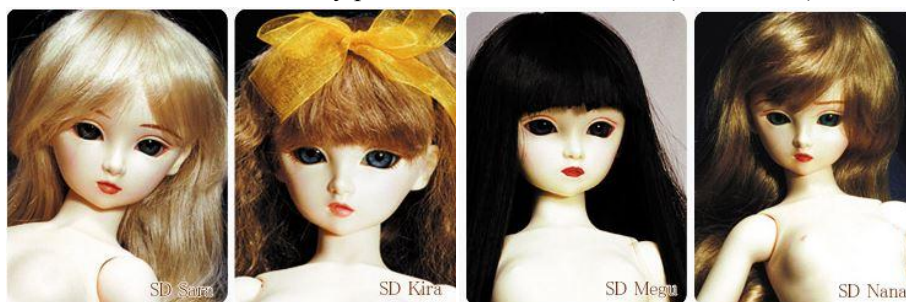
Figure 1.3: The first commercially produced Asian resin BJDs (Volks, 2011).

Around 2002 and 2003, South Korean companies started creating and producing BJDs. Customhouse and Cerberus Project were among the first Korean BJDs companies (He, 2009, p.14), and since then the Korean market has expanded with many more. It is also worth mentioning that the first American company to produce a BJD but