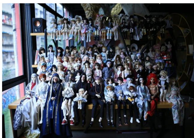
Figure 2.1: A private tea party for BJD owners held in a café in Chengdu (Gao, 2016).

Further, the boundary of the virtual space provided by social media sites is currently blurring between public and private. Pearson (2009) discusses the “glass bedroom metaphor” that social media sites have become, that is, a bedroom with walls made of glass and a bridge that is partially private and partially public, constructed online through signs and language (see Lincoln, 2012, p.193). BJD Bar, for example, contains content and comments posted for viewing by strangers, which represents the public sphere, as well as private conversations and intimate exchanges between