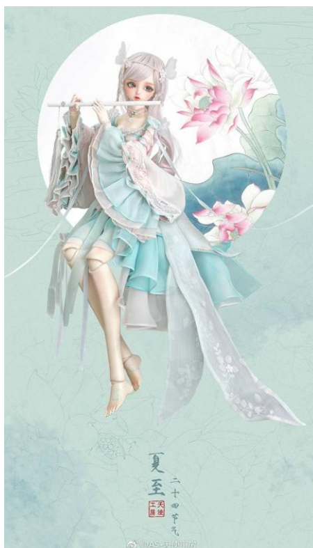
Figure 4.2: The BJD named Xia Zhi from Angell Studio (Angell Studio, 2017).

Then, in the second category, we see an intense fusion of Chinese traditional culture and contemporary popular culture in the BJD field. A good example is Fan's original BJD costume named "Meng Bi" Costume Patch (mengbi tuozhan bao) in 2016 (see Figure 4.3, p.74). On the whole, it still follows the traditional patterns of Chinese gown in Han Dynasty in its style and texture 25 . However, the cloth features a popular emoticon among Chinese youth named "Meng Bi (literally: stunned, off-guard, and confused)". Fan's costume not only elaborately remixes traditional styles and modern patterns but also conveys Chinese youth's current sensibilities. Sometimes, when traditional culture and popular culture integrate as a mature cultural products in popular literature or game domain, they get picked up in the BJD market. For example, one of