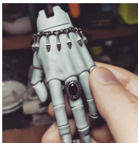
Figure 5.7: Ji's original handmade ring and bracelet for full large-sized BJDs (Ji, 2018).

The absence of masculine discourse and alienation of Chinese doll-daddies attribute to the remaining hegemonic masculinities and stereotypes. Constantinople (1973) defines “traditional masculinity” and “traditional femininity” as relatively enduring characteristics encompassing traits, appearances, interests, and behaviors that