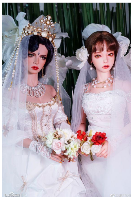
Figure 2.2: A lesbian BJD couple at their wedding ceremony (Mi, 2017).

On the other hand, doll-mommies and doll-daddies also are inclined to perform a value-based identity in BJD Bar topics instead of exhibiting it in front of parents or peers (Fu, 2017, p.137), so that distinct value judgments of BJDs and other unusual aspects cannot disrupt their relationships with people in their real physical worlds. In this case, online self-representations incorporating their ideological values are used to escape from the restrictions of the social contexts of their offline lives. More specifically, doll-mommies and doll-daddies rebel against or attempt to escape from traditional parental power, distinct consumption or aesthetic values among peers, and even societal legal or moral norms of their real lives. For example, although same-sex unions are not legal yet in China, a doll-daddy named Mi dresses his two female BJDs in wedding dresses and posts series of photographs of the lesbian BJD couple at their wedding ceremony (see Figure 2.2).